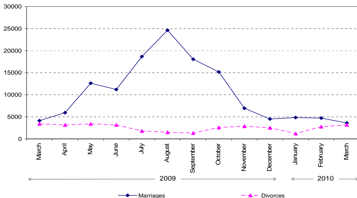
Evolution of the number of marriages and divorces during the period March 2009 - March 2010

3191 divorces were granted by final court decision (1.75 divorces per 1000 inhabitants), 424 more than in February.